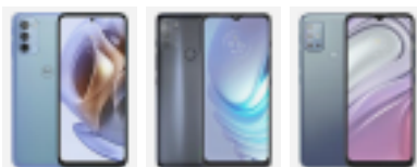
Motorola Moto G31